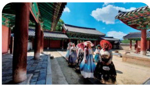
Jeonju Hanok Village, Hanbok experience