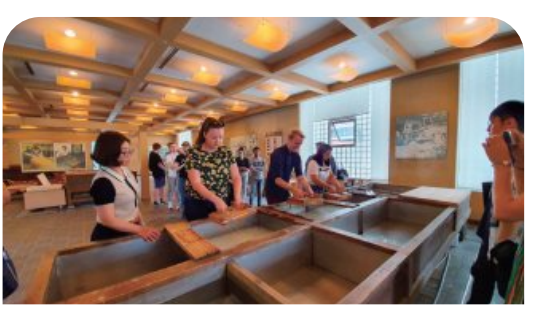
Hanji Craft Experience