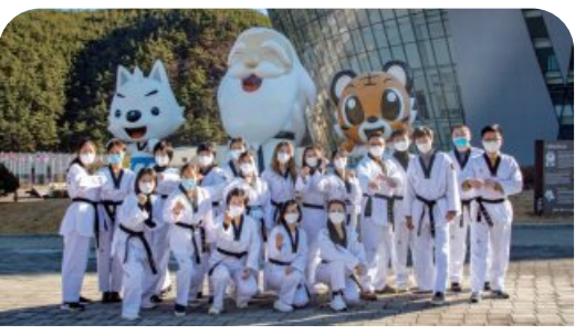
Muju Taekwondo Center (Taekwondo experience)