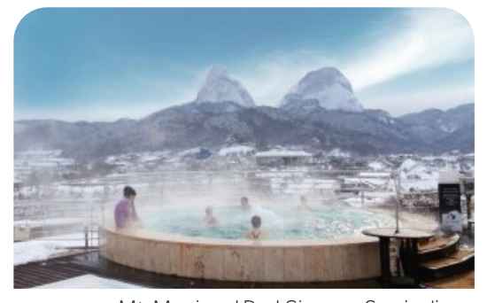
Mt. Ma-i and Red Ginseng Spa in Jinan