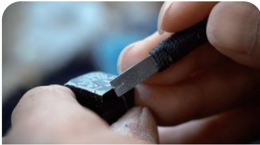
Making Handmade Stamp