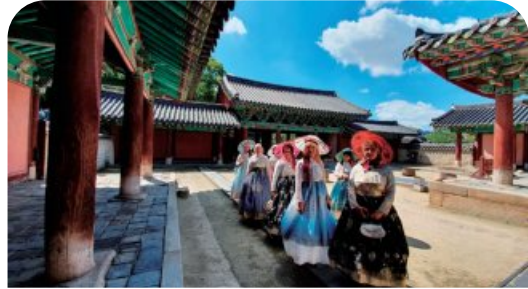
Jeonju Hanok Village, Hanbok experience