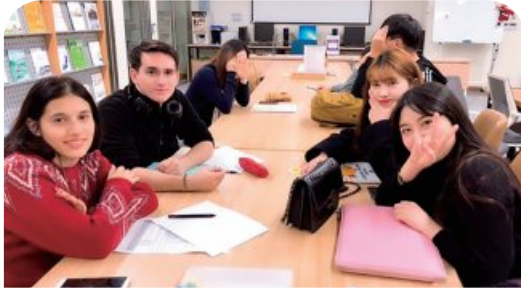
Korean language class