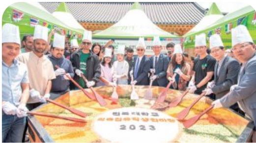
Making Bibimbap experience