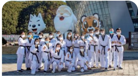
Muju Taekwondo Center (Taekwondo experience)