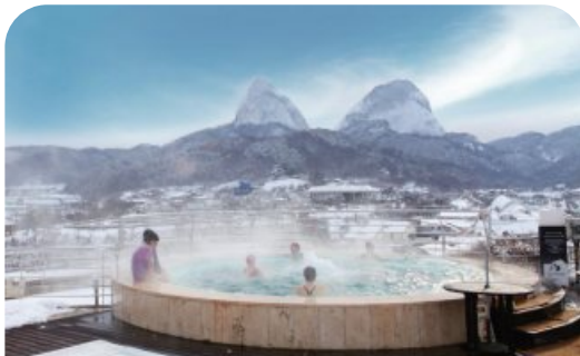
Mt. Ma-i and Red Ginseng Spa in Jinan