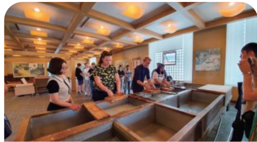
Hanji Craft Experience